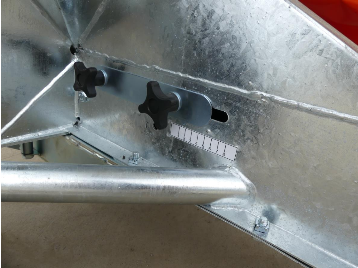
Setting 1: Minimum drop size

On the RH Side of the drawbar of the machine you will find two black handwheels and an indicator plate as shown below. Initially set the Feed adjustment plate to setting 2, as indicated by the arrow on the drop adjustment plate. To adjust, loosen BOTH hand wheels, and slide the unit forwards or backwards to the desired value. Tighten securely.