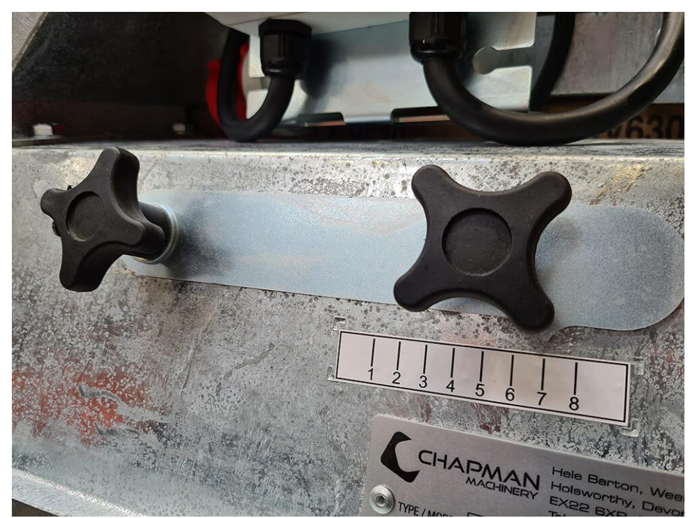
Setting 1: Minimum drop size

On the RH Side at the rear of the machine you will find two black handwheels and an indicator plate as shown below. Initially set the Feed adjustment plate to setting 2, as indicated by the arrow on the drop adjustment plate. To adjust, loosen BOTH hand wheels, and slide the unit forwards or backwards to the desired value. Tighten securely.